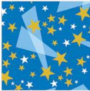
7891-MLB 4 yds (includes backing)