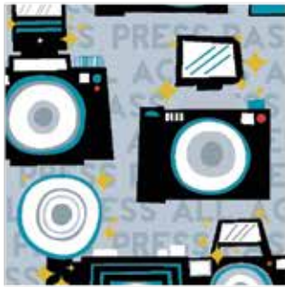
7890-MK 1/2 yd