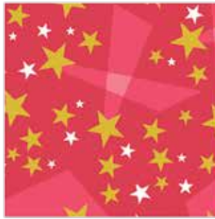
7891-MR 1 yd