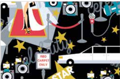
7889-MK 7/8 yd