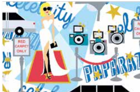
7889-ML 7/8 yd

Blend with fabrics from Dimples by Andover Fabrics