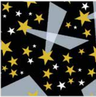
7891-MK 2/3 yd (includes binding)