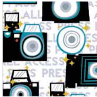
7890-ML 1/2 yd