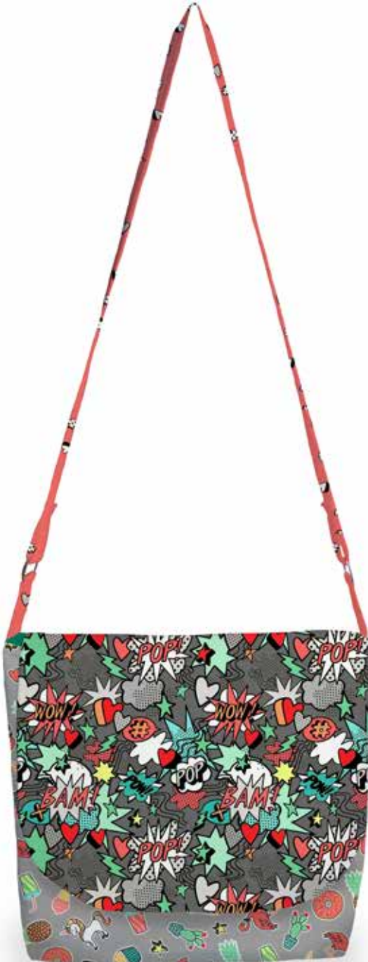
Bag A Grey

Finished Size 12" x 12" x 3" (30cm x 30cm x 7.5cm) excluding strap using the Pow collection from Makower UK www.makoweruk.com