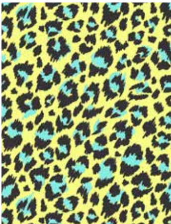
2040/Y Leopard Skin