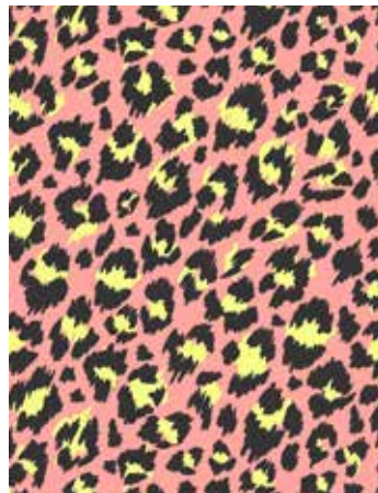
2040/P Leopard Skin