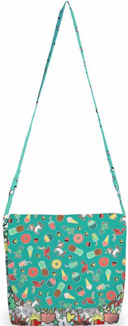
Bag B Turquoise