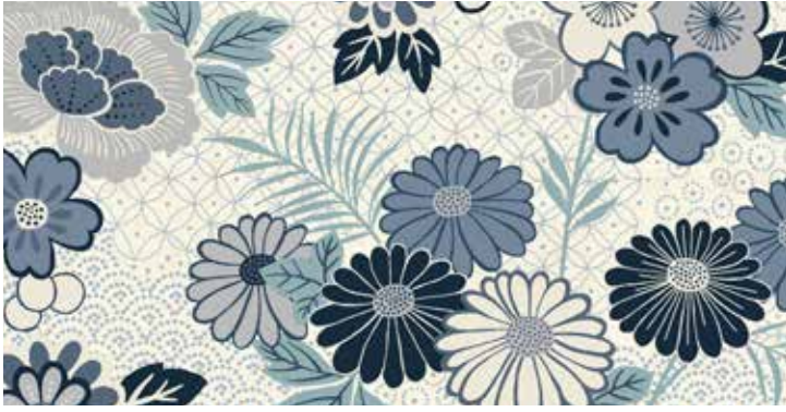
2150/Q Floral Montage