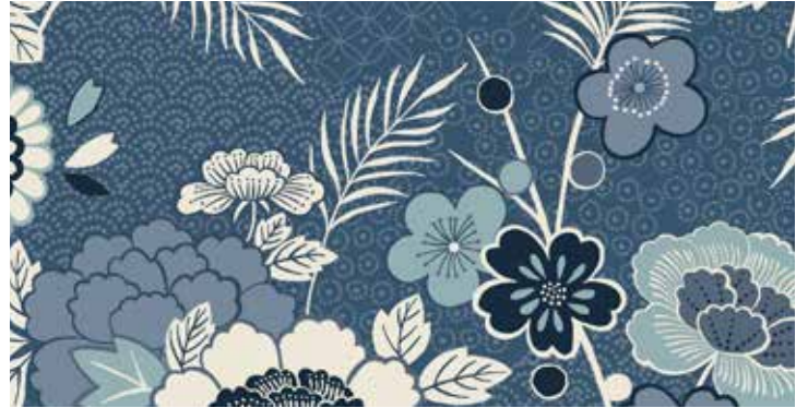
2150/B Floral Montage