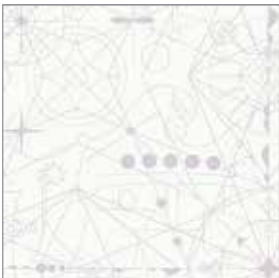
8673-P1 Fat ¼ yd