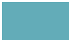
K-12-Dragonfly Fat ¼ yd