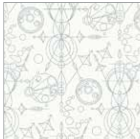
8073-C1 Fat ¼ yd (extra yds needed for backing)