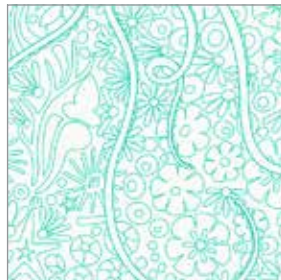
8634-T Fat ¼ yd