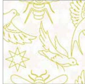
8446-G Fat ¼ yd