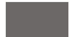
K-12-Charcoal 1¼ yds (includes binding)