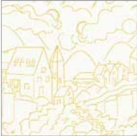
8071-Y Fat ¼ yd