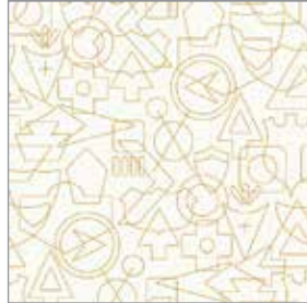
8905-Y1 Fat ¼ yd