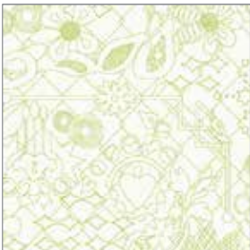
8482-G Fat ¼ yd