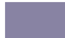
K-12-Hydrangea Fat ¼ yd