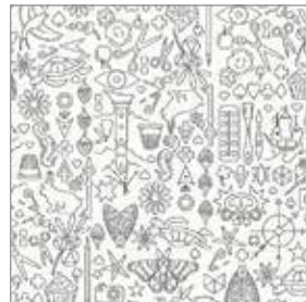
9036-K1 Fat ¼ yd