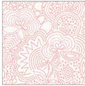
8450-R1 Fat ¼ yd