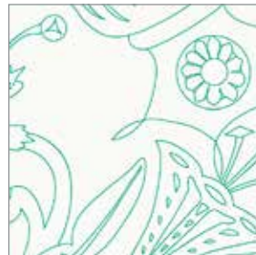
8069-T Fat ¼ yd