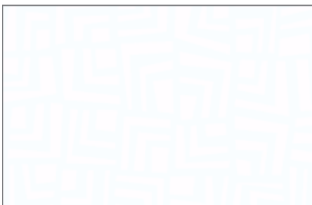
7848-WW ½ yd