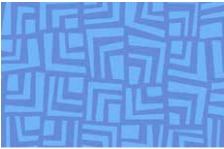
7848-B ½ yd