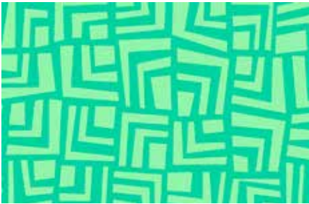
7848-G ½ yd