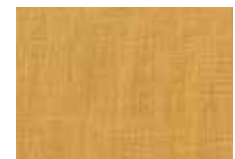
A-T-Smudge ½ yd