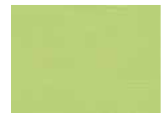
A-T-Envy ½ yd