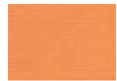
A-T-Indian Summer ½ yd