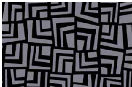
7848-K ½ yd