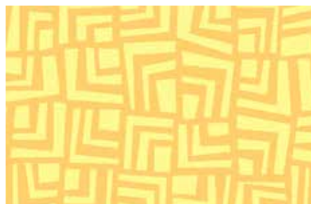
7848-Y ½ yd