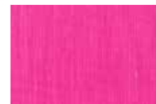
A-T-Blaze 1 yd (includes binding)

Blend with Andover fabrics from A-T-Textured Solids