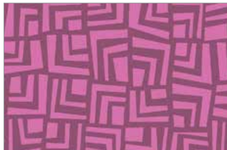
7848-P ½ yd