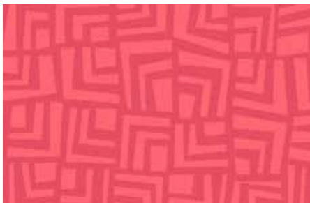
7848-R ½ yd