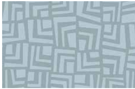
7848-C ½ yd