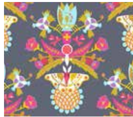
7865-C Fat ¼ yd (extra yds needed for backing)