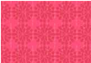
7868-CR Fat ¼ yd