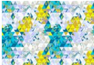
7867-L Fat ¼ yd