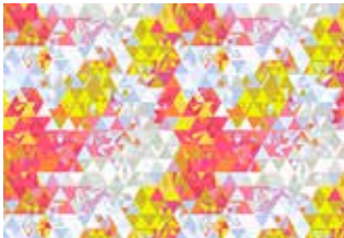
7867-C Fat ¼ yd