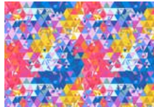
7867-LP Fat ¼ yd