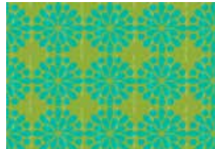
7868-LG Fat ¼ yd

Blend with fabrics from Chambray by Andover