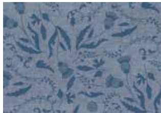
7866-LB Fat ¼ yd