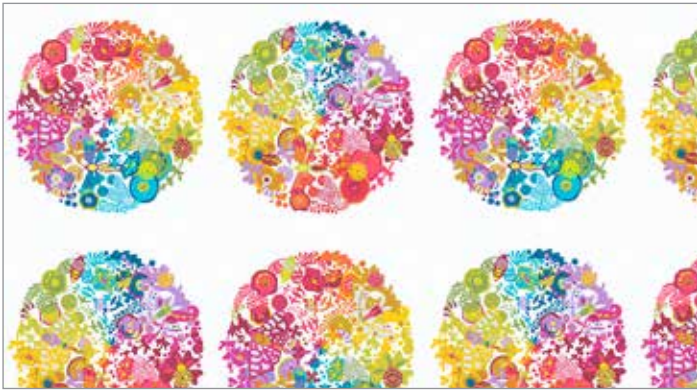
7864-L Fat ¼ yd