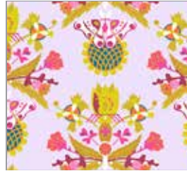
7865-CE Fat ¼ yd