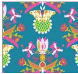
7865-LT Fat ¼ yd