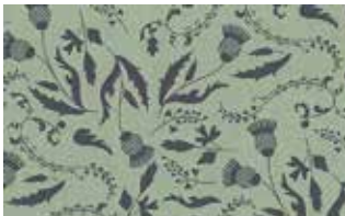
7866-CV ¾ yd (includes binding)