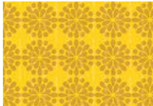
7868-CY Fat ¼ yd