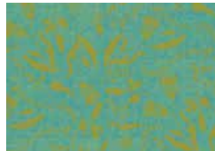
7866-LG Fat ¼ yd