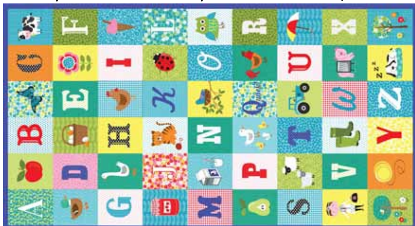
*1336/1 PANEL - each panel 60cms / 24" (10% of actual size)

Fabrics shown are 50% of actual size unless otherwise stated