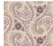
7320-P ⅝ yd