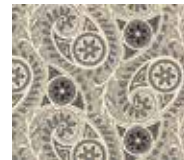
7320-K ⅝ yd