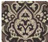
7318-K ⅝ yd