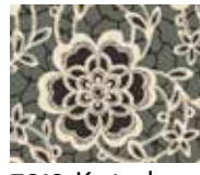
7319-K 4 yds (backing)