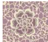
7319-P 1 yd