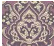
7318-P ⅝ yd