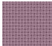
7390-P ⅝ yd (includes binding)