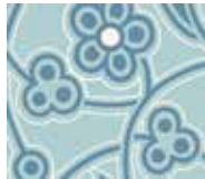
7327-B fat ¼ yd