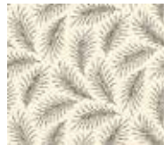
7332-K fat ¼ yd