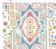
7325-B fat ¼ yd