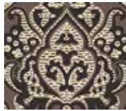
7318-K fat ¼ yd