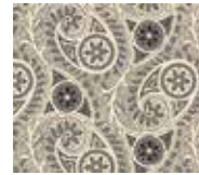
7320-K fat ¼ yd