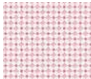
7390-BR fat ¼ yd