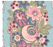
7328-B fat ¼ yd