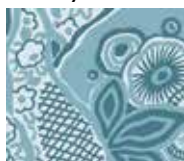
7324-B fat ¼ yd