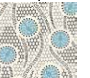
7326-B fat ¼ yd