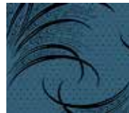
7322-B 1 yd