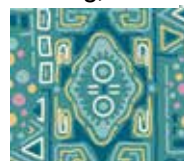
7325-ET fat ¼ yd