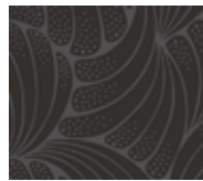
7330-GK fat ¼ yd