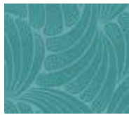
7330-ET fat ¼ yd