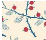
7321-R fat ¼ yd