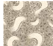
7323-GN fat ¼ yd