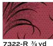
7322-R ¾ yd (includes binding)