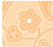
7327-O fat ¼ yd