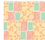
7329-O fat ¼ yd