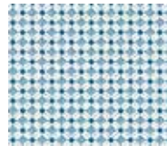
7390-RB fat ¼ yd