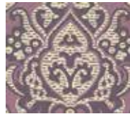
7318-P fat ¼ yd