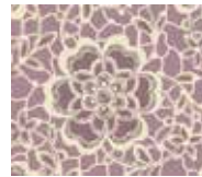
7319-P fat ¼ yd