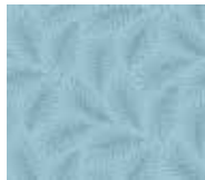
7332-B fat ¼ yd