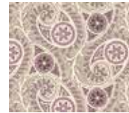
7320-P fat ¼ yd