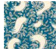
7323-RB fat ¼ yd