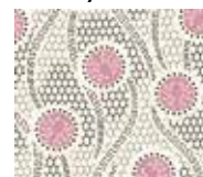
7326-E fat ¼ yd