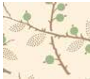
7321-G fat ¼ yd