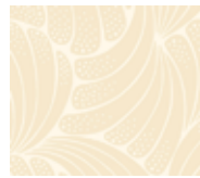
7330-UGL fat ¼ yd