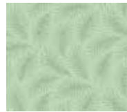
7332-OG fat ¼ yd