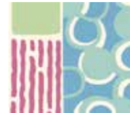
7329-B fat ¼ yd