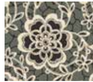
7319-K fat ¼ yd