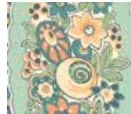
7328-OG fat ¼ yd