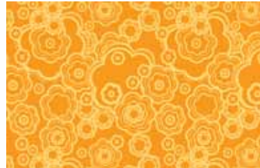
5420-Y 7/8 yd