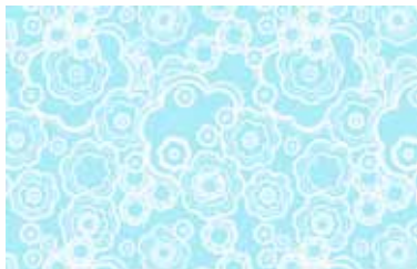
5420-W 1/2 yd