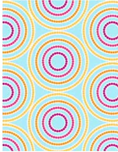
5417-B 2/3 yd