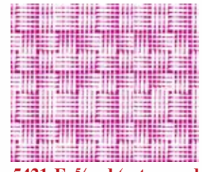
5421-E 5/8 yd (extra yardage needed for backing)