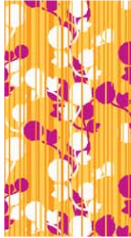
5418-Y 1 1/8 yds