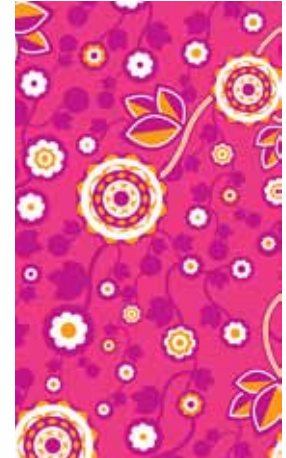
*5419-E 1 yd (includes binding)