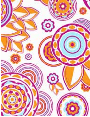
5416-L 1 1/8 yds