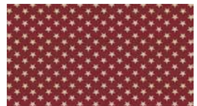
*4223-R ½ yd (Extra yardage needed for backing – 4¼ yds) Pillowcase: 1 yd