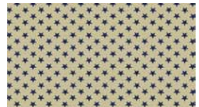
4223-LB ½ yd