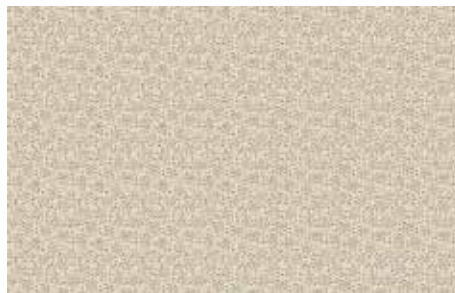
3985-M ½ yd