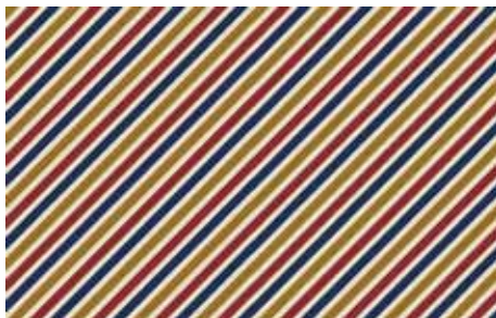
3984-M 2½ yds (includes binding)