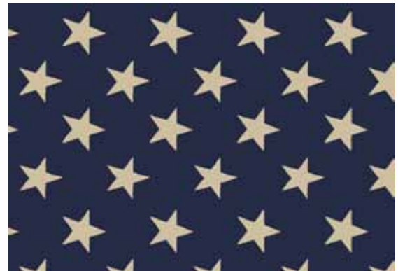
2879-B 1 yd