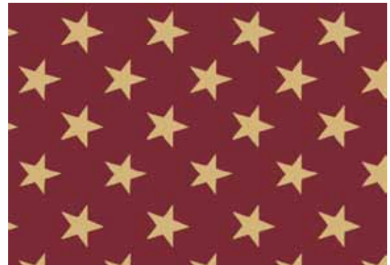
2879-R2 1 yd