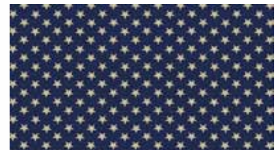
4223-B ½ yd